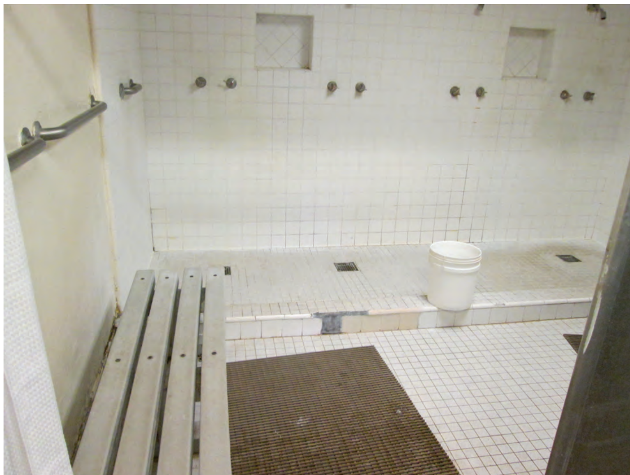
D-West Low Dorm Shower Area