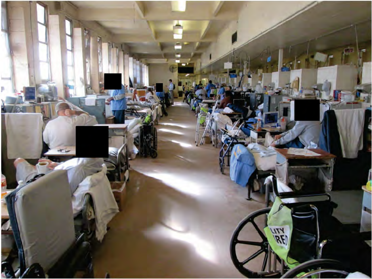
D-Elm Bed Area