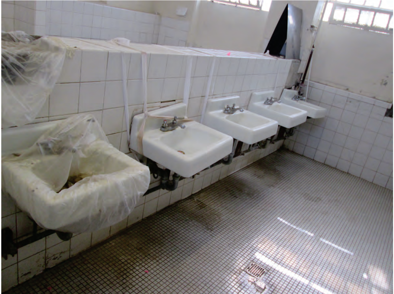
D-Cedar Restroom Sinks