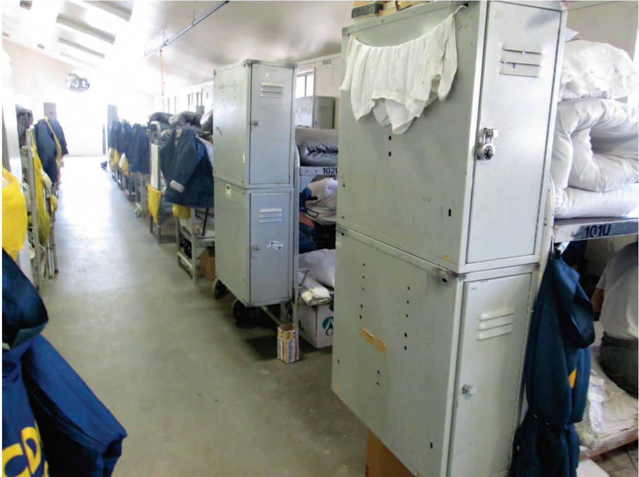
A-Joshua Lockers and Beds