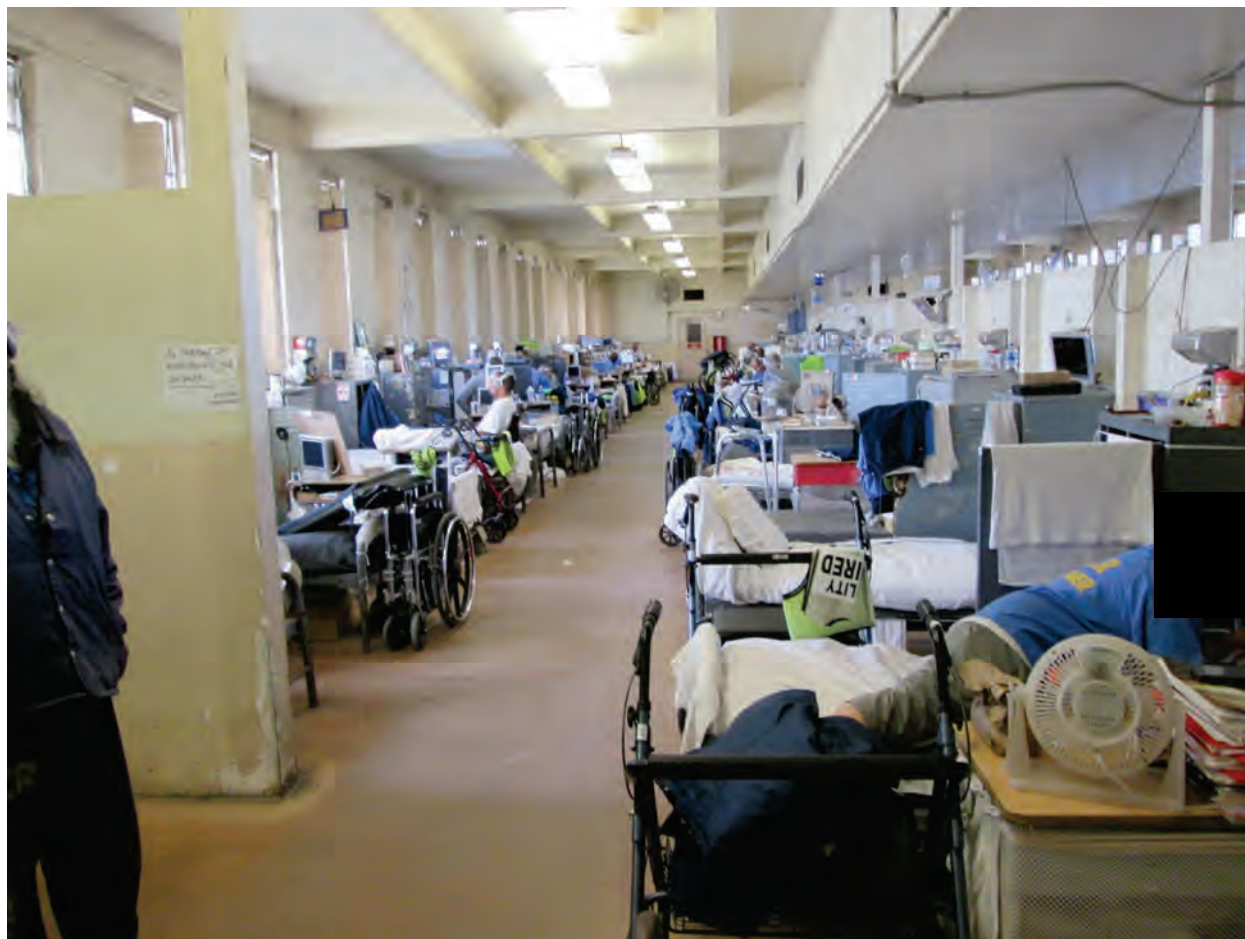
D-Elm Bed Area