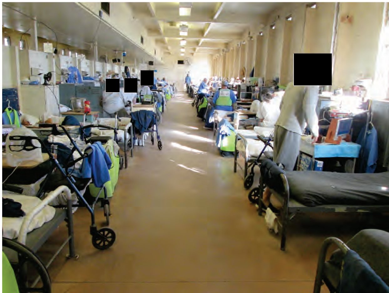
D-Elm Bed Area