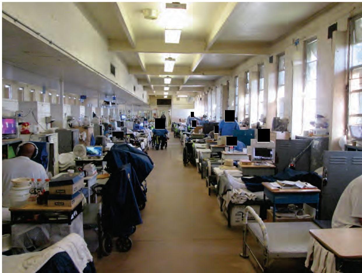
D-Elm Bed Area