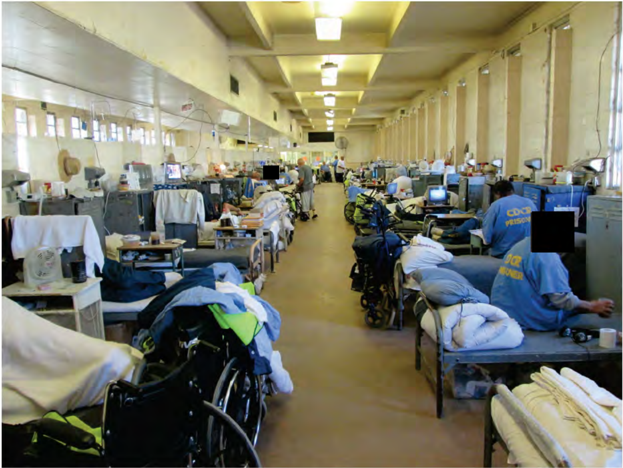
D-Elm Bed Area