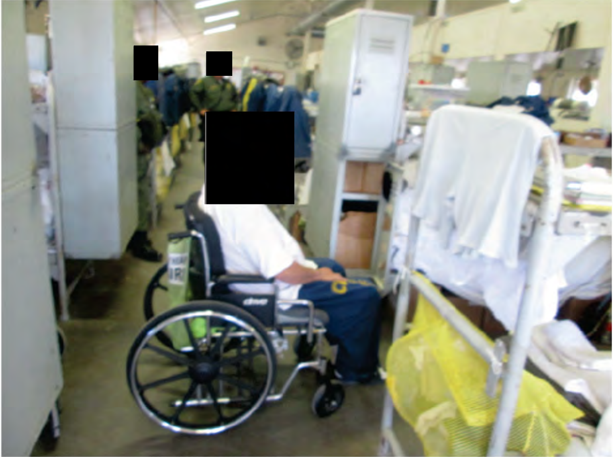
A-Joshua Lockers and Beds