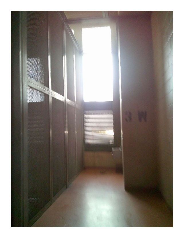
[Photograph 3: 3West recreation cages]

In 3East, people are allowed their 30 minutes out-of-cell with other people, but only a few at a time. We were told that the reason people cannot have more out-of-cell time is because so many people have to be let out in a 24-hour period. As a result, time in the dayroom is limited, and some people are offered it at night. This is particularly concerning for individuals with disabilities who may be unable to take dayroom at any time of day due to medical conditions. In this unit, jail leadership told us people had access to a recreation yard. However, the yard is a concrete box with little to no equipment. While individuals can see the sky from the yard, they told us it only gets direct sunlight for a limited time each day, and some people told us they are consistently let out only at night. We were told dayroom operates on a 24-hour cycle.